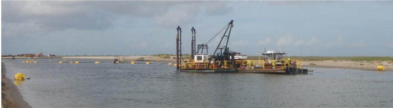
Figure 2. Dredge working in Vinson Slough.

RLB completed dredging in the western end of the Vinson Slough template this week and began sweeping excess sand within Vinson Slough at various locations. Total advance along the Vinson Slough design template is 7,600 feet since the project began. The hydraulic dredge working in Vinson Slough is shown in Figure 2.