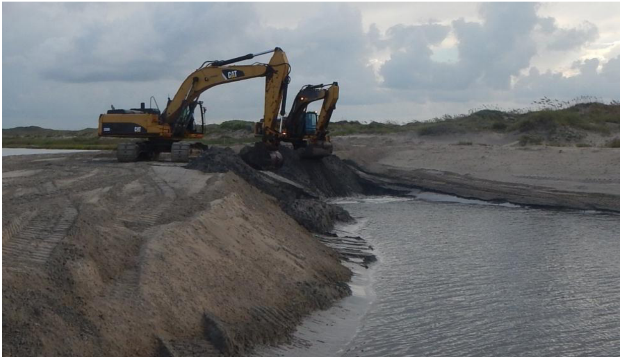
Figure 1. Excavators working in Cedar Bayou.

Excavation of Cedar Bayou has continued this week using 1 excavator and 6 off-road trucks with excavation in the Gulf expected to begin shortly. The total advance in Cedar Bayou is approximately 6,700 feet since the start of the project. Excavator working in Cedar Bayou can be seen in Figure 1.