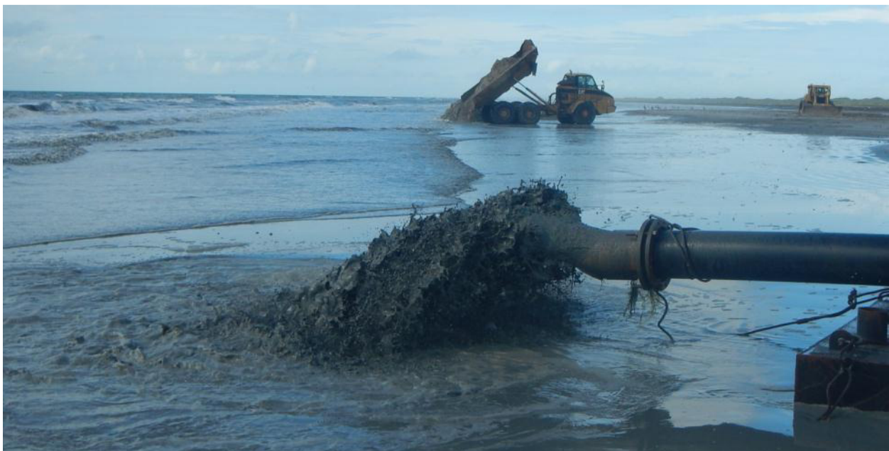
Figure 3. Off-road truck placing material and the dredge outfall on Placement Area 2

All material excavated from Cedar Bayou is transported by off-road trucks along the haul route and dumped into Placement Area 2. Material dredged from Vinson Slough is transported via pipeline to Placement Area 2. Figure 3 shows an off road truck placing material and the dredge outfall on Placement Area 2.