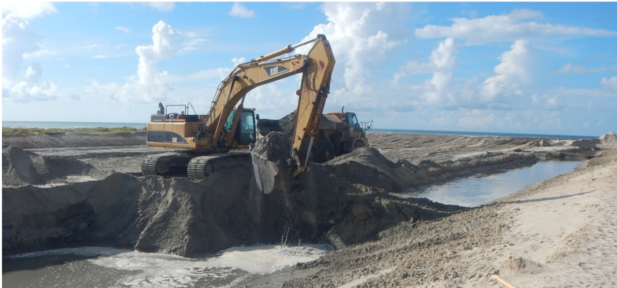
Figure 1. Excavator executing the full cut in Cedar Bayou.

Excavation of Cedar Bayou has continued this week using 1 excavator and 6 off-road trucks. The total advance in Cedar Bayou is approximately 6,300 feet since the start of the project. An excavator working in Cedar Bayou with the Gulf of Mexico in the background can be seen in Figure 1.