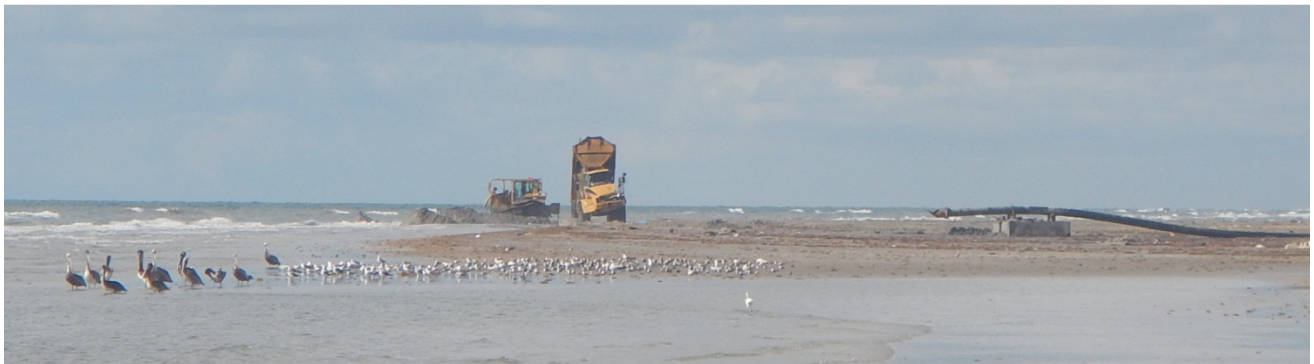
Figure 3. Off-road truck placing material and the dredge outfall on Placement Area 2

All material excavated from Cedar Bayou is transported by off-road trucks along the haul route and dumped into Placement Area 2. Material dredged from Vinson Slough is transported via pipeline to Placement Area 2. Figure 3 shows an off road truck placing material and the dredge outfall on Placement Area 2.