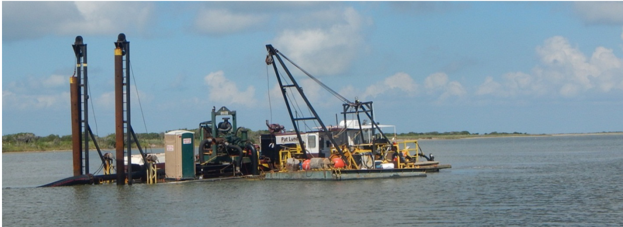
Figure 2. Dredge working in Vinson Slough.