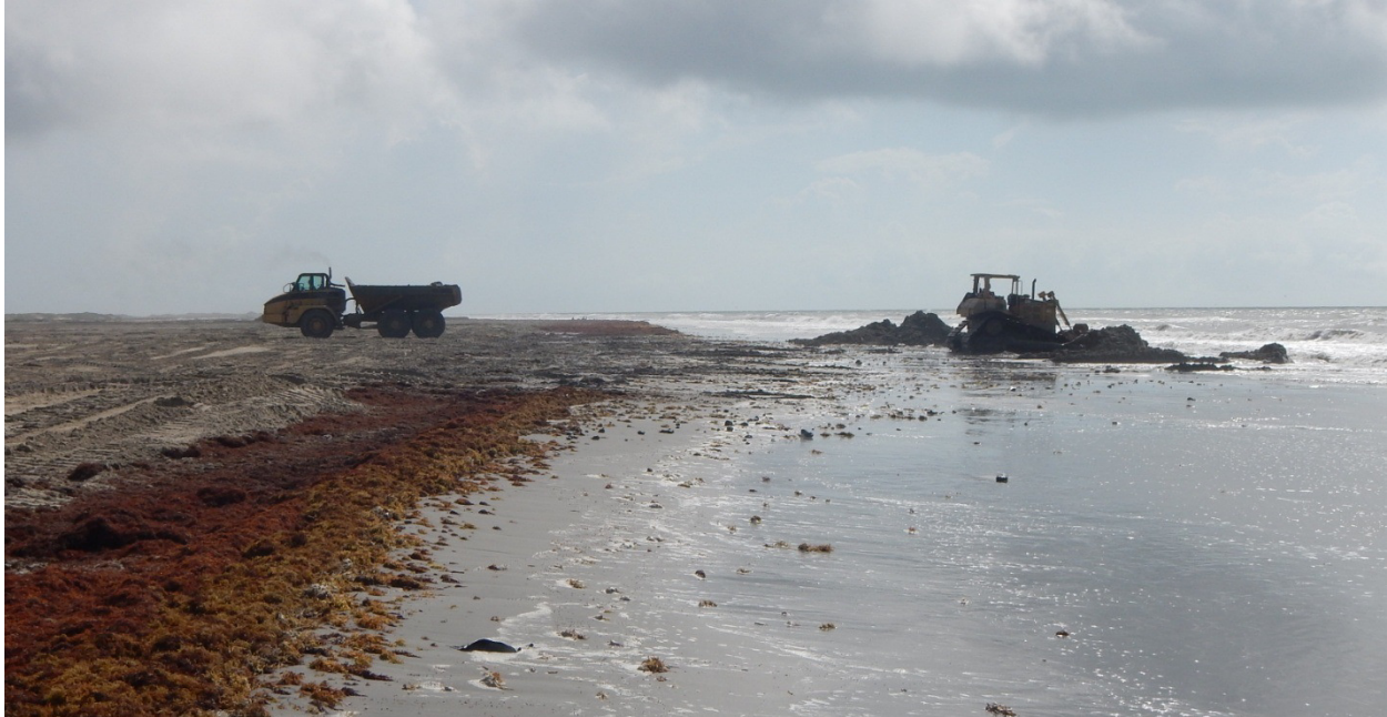
Figure 3. Material being placed and graded in Placement Area 1.