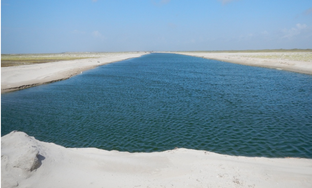
Figure 2. Excavation of Vinson Slough looking east from Cedar Bayou.

RLB continued excavation in Vinson Slough near the intersection with Cedar Bayou making a total advance of 2,800 feet along the design template using 2 excavators and 5 off-road dump trucks. Progress in Vinson Slough is shown in Figure 2.