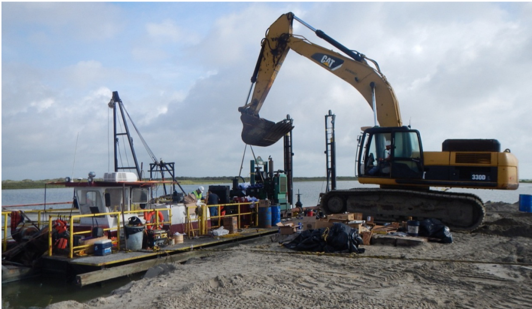
Figure 1. Hydraulic dredge down for repairs this week.

Dredging has continued in Cedar Bayou with approximately 2,400 feet of total advance since the start of the project. The contractor continues to maintain the silt curtains around the active dredging area to protect nearby aquatic resources as the dredge advances. Figure 1 shows the hydraulic dredge down for repairs this week.